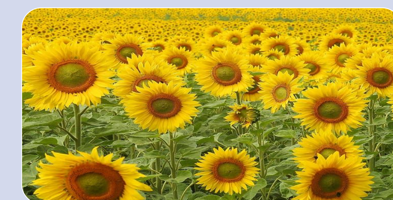
Care Team Wellness

Through a partnership between ATSU's School of Osteopathic Medicine in Arizona, the Arizona School of Dental and Oral Health and Community Health Centers across the nation, our Alliance, brings together administrators, faculty, and clinical providers from the fields of medicine, dentistry and behavioral health to increase capacity and address three key areas: Integrated Behavioral Healthcare, Opioid Use Disorder/Substance Use Disorder (OUD/SUD) and Care Team Wellness.